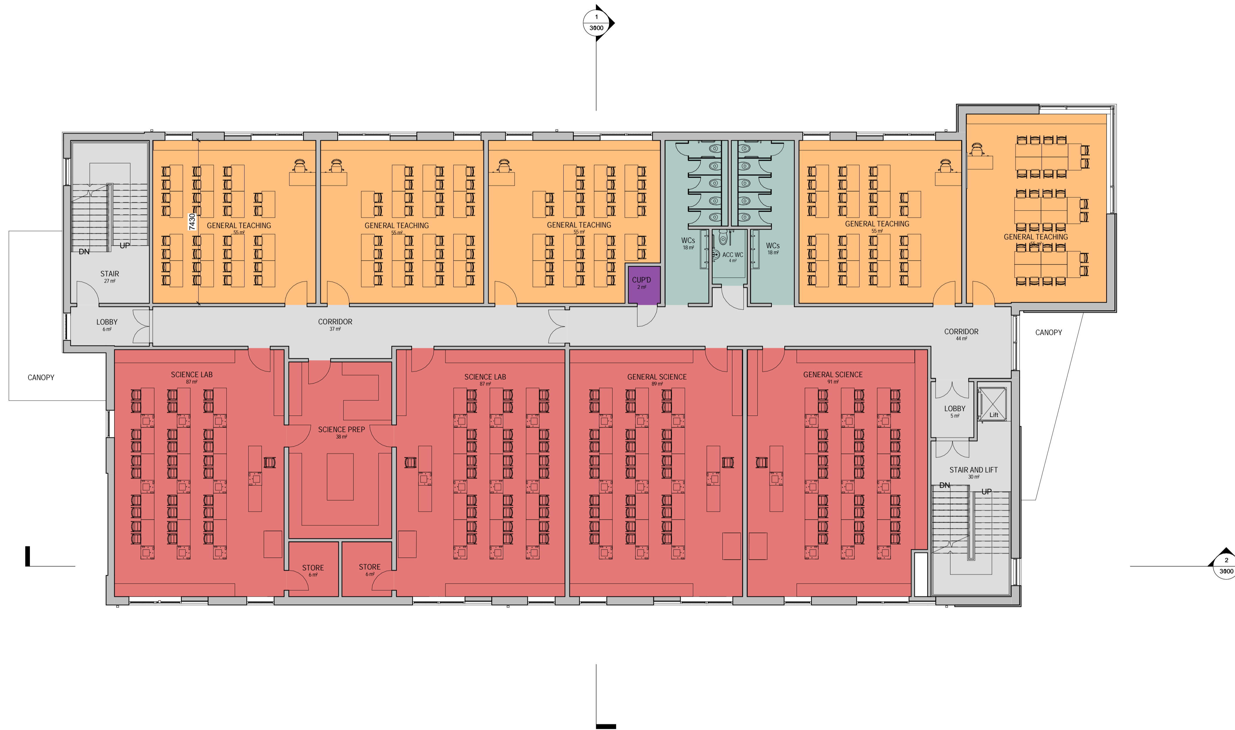
First Floor GA Plan 1 : 100

Note: Do not scale this drawing. All levels and dimensions are to be checked on site. This drawing is to be read in conjunction with all relevant consultants' requirements, drawings and specifications. Any discrepancies between consultants' drawings to be reported to the Contract Administrator before any relevant work commences.